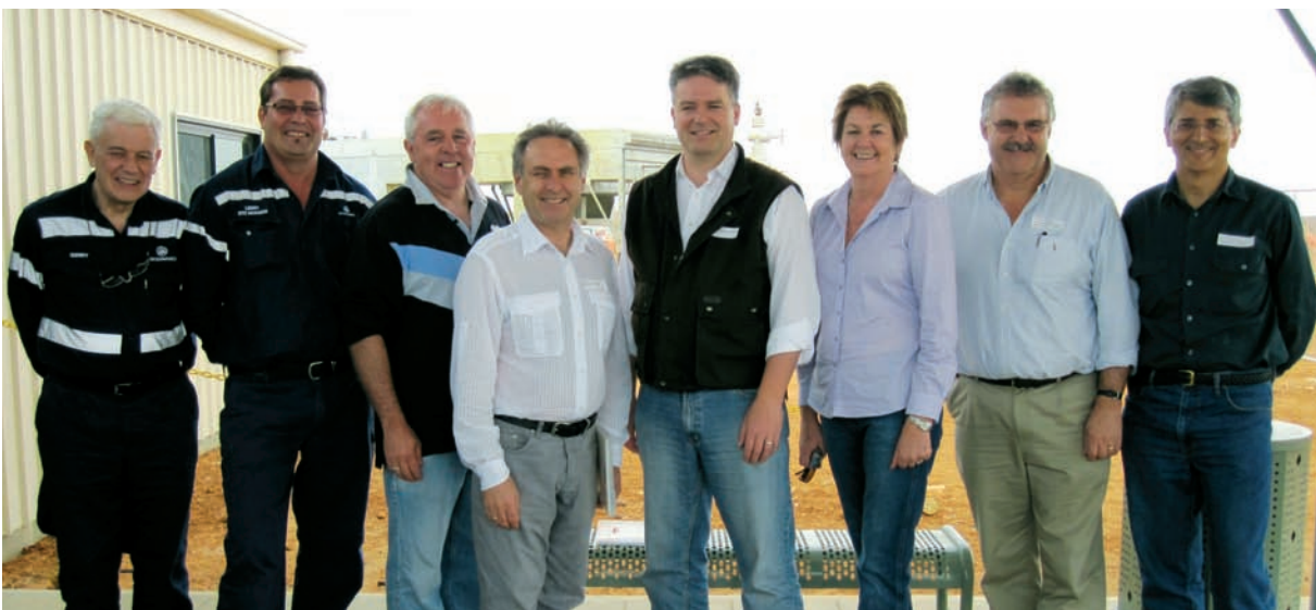
Senate Select Committee on Fuel and Energy visit the 1 MW Power Plant and Visitor Centre September 2009

The Visitor Centre is now open between 10 – 11 am daily and is situated at Geodynamics Habanero camp which is approximately 15 minutes drive towards Moomba from Innamincka down the New Strezlecki Track.