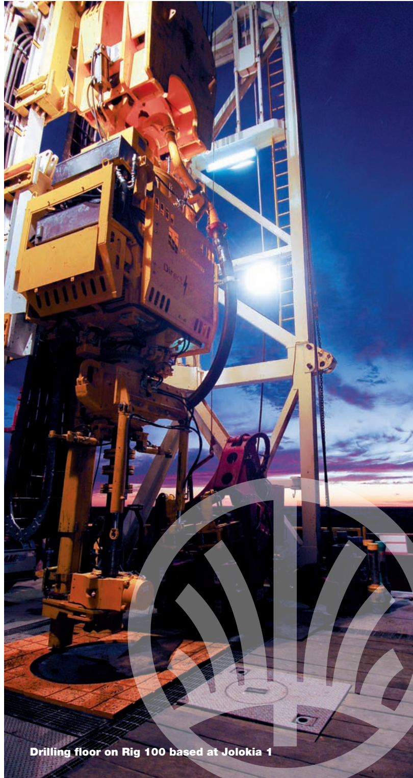
Drilling floor on Rig 100 based at Jolokia 1

During January 2009, Geodynamics intersected free flowing, overpressured fracture whilst drilling the Savina 1 well. This fracture was interpreted to be highly productive and more overpressured than at either Jolokia 1 or Habanero 3. The existence of this fracture is indicative of a saturated and over pressured reservoir comparable to those observed at both the Jolokia and Habanero locations.