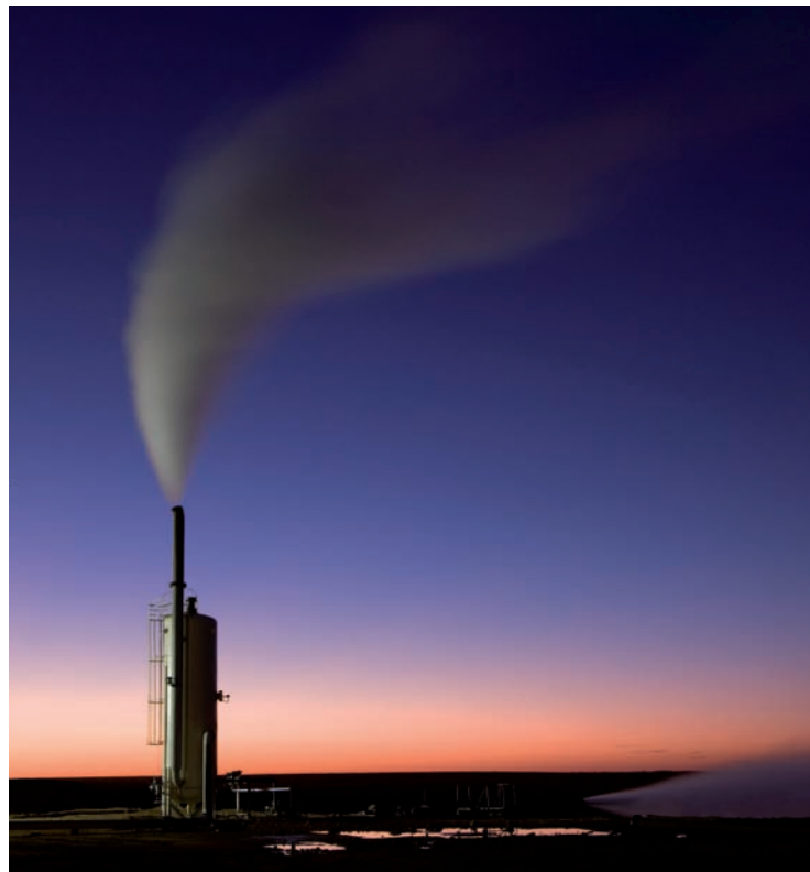
Steam flow from Habanero 3 in March 2008

Early in 2009, the Company announced a bonus option issue where shareholders were given one option for every four shares held with a conversion price of $1.50. The options issued under this program expire on 8 December 2009.